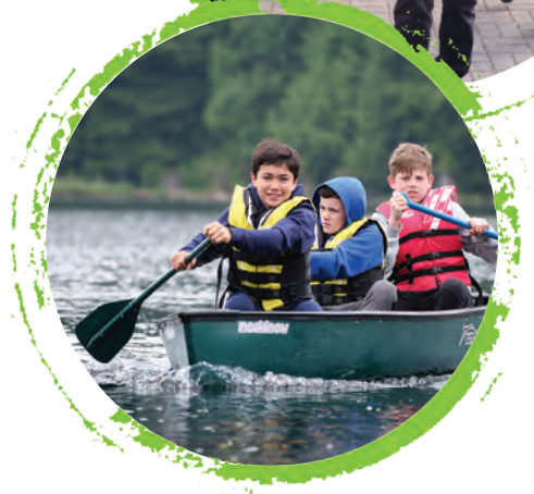
PICTURED FROM TOP: Catholic Youth Convention, Seminarians, CYO Camp