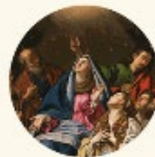
SOLEMNITY OF PENTECOST 5/19