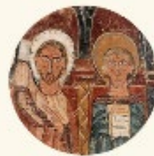
FEAST OF SAINTS PHILIP & JAMES 5/3