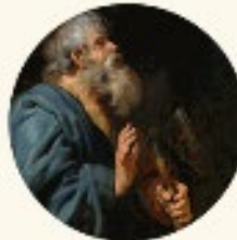
FEAST OF ST. MATTHIAS 5/14