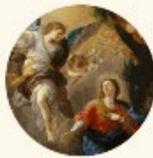
SOLEMNITY OF THE ANNUNCIATION 4/8