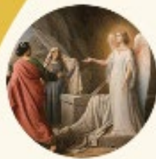
SOLEMNITY OF EASTER 3/31