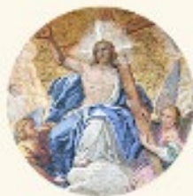
SOLEMNITY OF THE ASCENSION 5/12