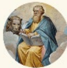
FEAST OF SAINT MARK THE EVANGELIST 4/25