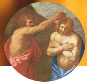
FEAST OF THE BAPTISM OF THE LORD 1/8

As Catholics, we celebrate the feasts and solemnities of the Christmas Season from Christmas Day to the Feast of the Baptism of the Lord. Learn more at archseattle.org/Christmas