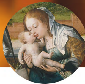
SOLEMNITY OF MARY 1/1