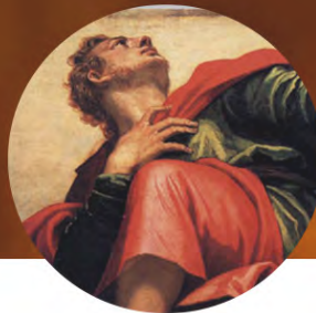
FEAST OF SAINT JOHN 12/27