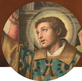
FEAST OF SAINT STEPHEN 12/26