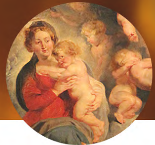
FEAST OF THE HOLY INNOCENTS 12/28