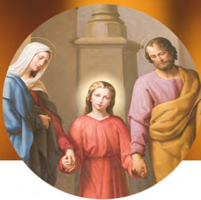
FEAST OF THE HOLY FAMILY 12/31